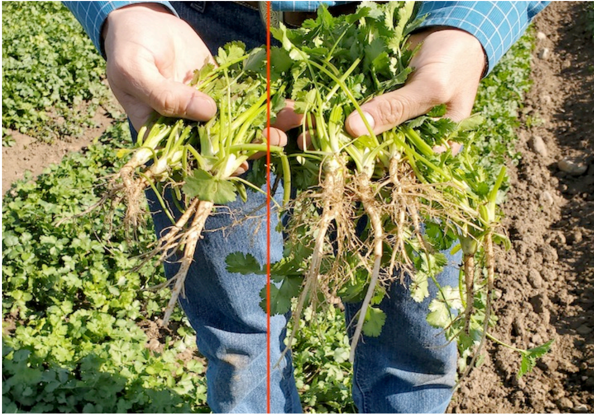
Picture taken from trial #2 at the time of harvest of a cilantro plant from the control (left) and a cilantro plant from the Humic Land block (right).

“Humic Land has proven to increase cilantro yields by 20% over 10 different fields. Cilantro root establishment is noticeably better. Cilantro stands with Humic Land are visibly more established.”