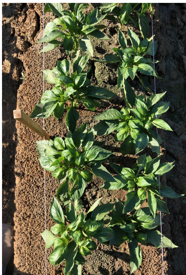
Control Block. Image taken mid September after the second application.