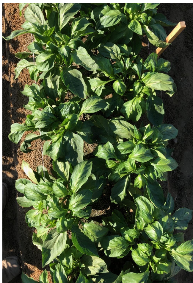
Humic Land Block. Image taken mid September after the second application.